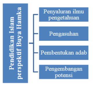
Figure 1. The Concept of Islamic Education from the HAMKA Perspective