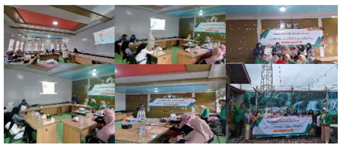
Figure 2. Training Activities for Creating E-commerce and Preparing Financial Reports Based on Computer Accounting