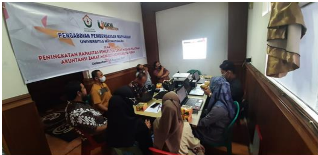
Figure 2 Discussion

From the results of discussions and sharing with participants during the implementation, it can be mapped that their weaknesses and shortcomings in understanding zakat accounting standards are in accordance with PSAK 109. The root cause is firstly, many zakat administrators (amil) do not have an accounting background or an economic background. The two records that they do are limited to cash inflows and outflows, thirdly they have not prepared periodic financial reports for managing ZIS funds.