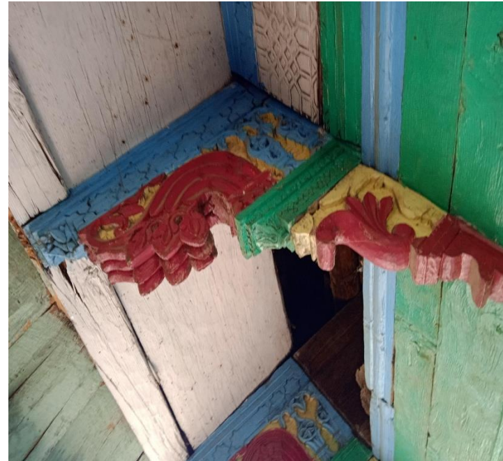
Wood Carving Designs

The Khanqah portion of the shrine is built completely out of solid timber blocks, which function both as load-bearing and support components. Brick infill provides further solidity to the structure. The building is elevated on a plinth, and a tunnel has been built through it so that water may flow through the Khanqah without causing any harm to the structure. The Khanqah has two