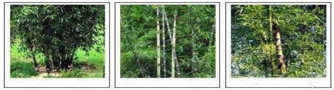
Figure 3. Three types of bamboo are often used as ground cover plants. From left to right: Gigantochloa apus, Dendrocalamus asper, and Bambusa bambos

The selection of ground cover plants in addition to meeting the requirements, should also consider the economic benefits of plants. It is hoped that, apart from being useful in preserving the environment, local residents can also earn additional income from these plants. One example of a plant that meets these criteria is bamboo. Bamboo has a strong fibrous root structure that is able to withstand the rate of erosion. The growth of bamboo clumps is also very fast and environmental tolerance is very high, and has the ability to improve effective water catchment sources so it is very suitable for reforestation in open or deforested forests due to logging (illegal logging). Bamboo plants are also very good for use as protective plants on river cliffs or ravines (Figure 3)