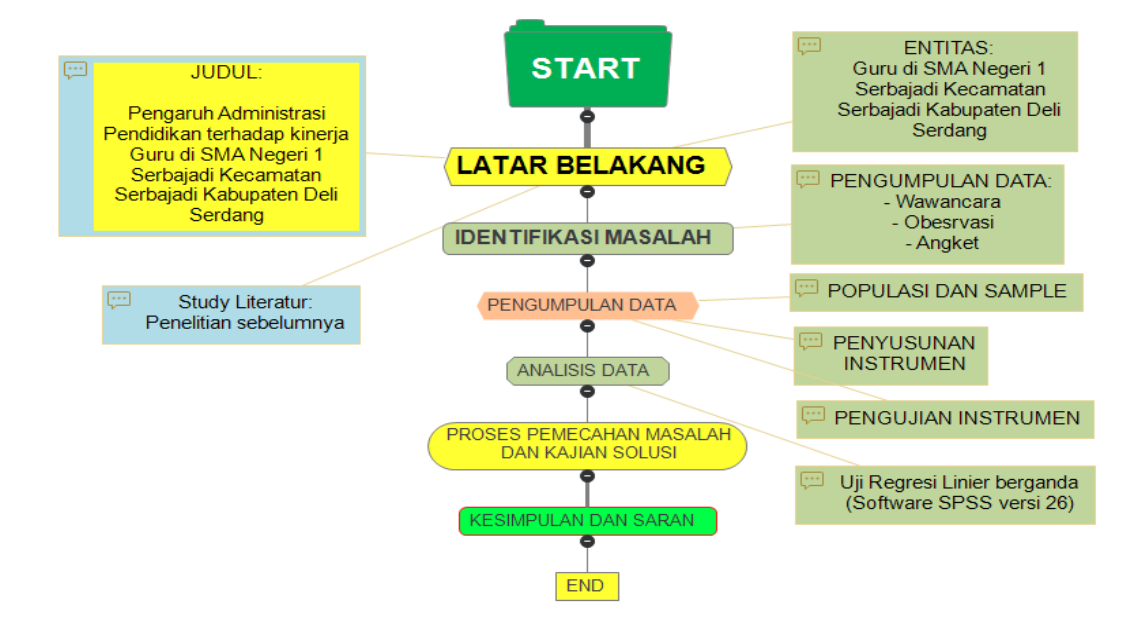
Picture1. Thinking Framework Diagram

The framework for this study is to describe the population and sample regarding the influence of education administration on teacher performance at SMA Negeri 1 Serbajadi, Serbajadi District, Deli Serdang Regency. By carrying out the preparatory steps, the implementation stage to get the results according to the following diagram: