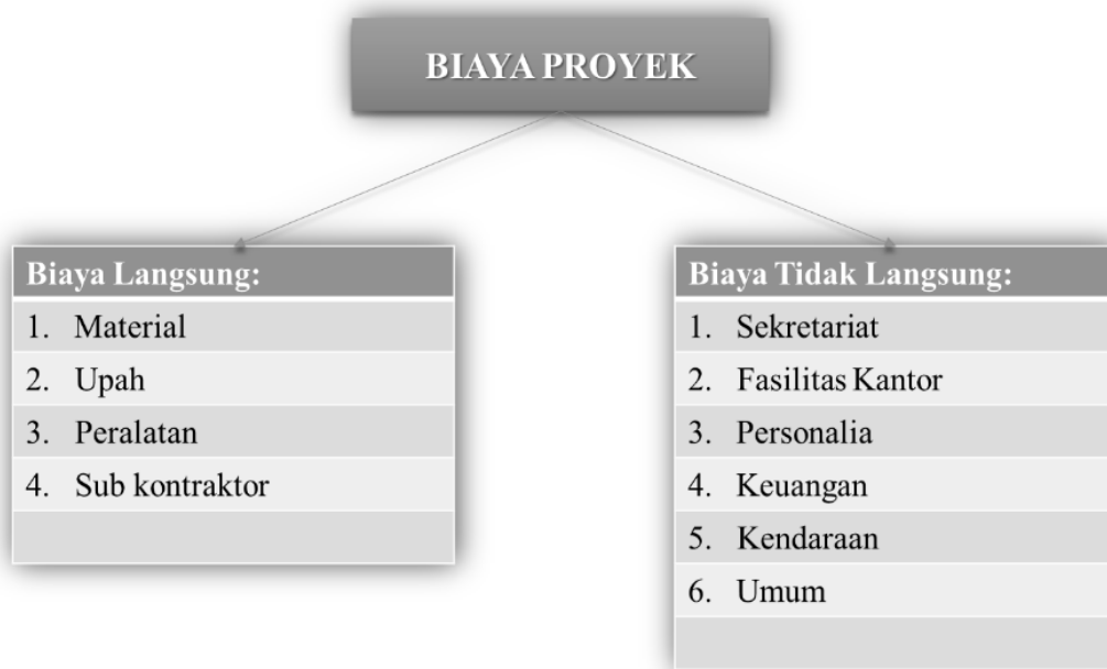
Figure 1.1 Project Cost Components Source: Secondary Data Processing, 2020

PT. Wijaya Karya (Persero) Tbk together with PT. Bumi Karsa as the implementing contractor for the Lau Simeme Dam construction project also experienced time and cost problems in completing the project. Project financing is divided into 2 (two) major parts, namely Direct Costs and Indirect Costs as shown in the following chart: