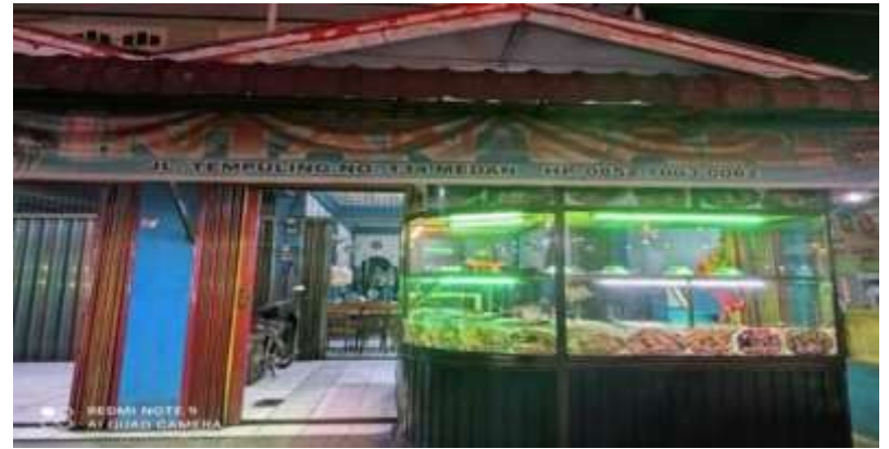
Figure 1. Front view of RM. Intan Sari

close to several universities and busy centers. This restaurant has a Padang restaurant concept by providing a menu of typical Padang dishes, such as rendang, balado beef jerky, kalio, sour padeh fish, and so on.