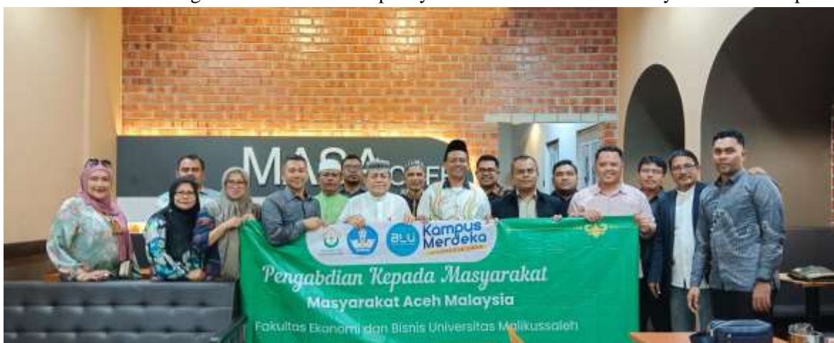
Figure 5.1 Community Service in Aceh, Malaysia

Community service activities with the title Empowering the Acehese Community in Kuala Lumpur, Malaysia for Capacity and Preparation for Independence are carried out in several stages, namely observing initial data, coordinating by collecting initial data then continuing with Focus Group Discussions, preparing implementation stages and then implementation. service activities for Increasing the Self-Reliance Capacity of the Acehese Community in Kuala Lumpur.