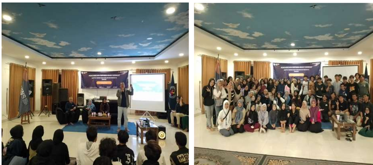
Figure 2. Presenters and participants in the MSME-Community Service Training

The following is a further explanation of the results and discussion: