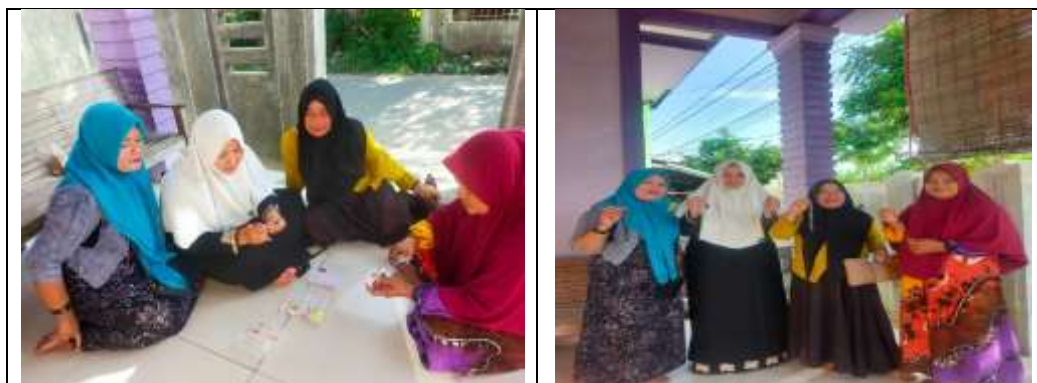
Figure 1: Training Activity

Malikussaleh University implementation team. Participants in this empowerment assistance activity are the people of Gampong Tempok Teungoh, Banda Sakti Subdistrict, Lhokseumawe City, consisting of the women's community supported by the officials of Gampong Tempok Teungoh, Banda Sakti Subdistrict, Lhokseumawe City. The benefit of this activity is to increase insight for the community about the art of meroning is the art of making crafts by stringing or arranging objects to make objects in a new form such as bracelets, necklaces, rings, brooches, and so on. The results of tying are objects that can be used for various purposes such as jewelry, window decorations, worship tools and others.