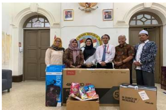
Picture 4. Hand over of electronic goods to SIKL