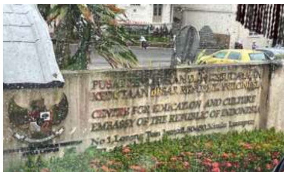
Picture 3. Sekolah Indonesia Kuala Lumpur