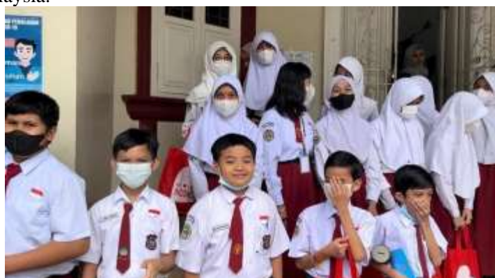
Picture 2. Students at Sekolah Indonesia Kuala Lumpur

This aligns with the objectives SDGS number four, which aims to ensure inclusive and equitable quality education and increasing lifelong learning opportunities for all. Therefore, the International community service initiative involving the Postgraduate Lecturers of Economics, University of North Sumatra and Sekolah Indonesia Kuala Lumpur, Malaysia has agreed to implement the program "Library Digitalization Through the Provision of Facilities of Sekolah Indonesia Kuala Lumpur (SIKL)" to further enhance the capabilities of Indonesian children living in Kuala Lumpur, Malaysia.