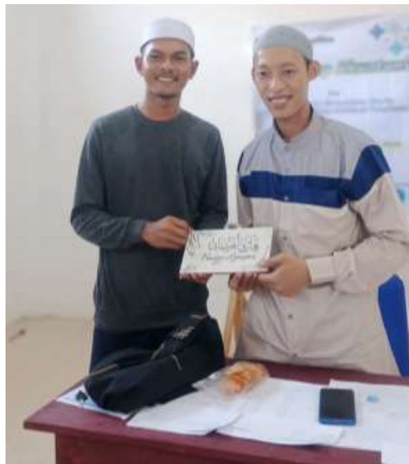
Figure 9. Unique Products From Dayah Students