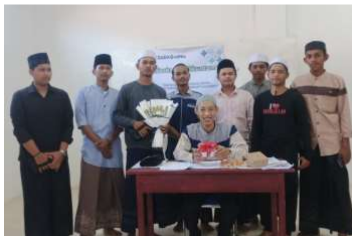
Figure 4. Participants in the Application of the Blessing Accounting Concept