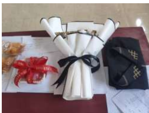
Figure 5. Creative Works and Unique Products of Dayah Students

Creating unique and superior products. Based on all the knowledge about Islamic business and finance that has been obtained, all participants will be given the opportunity to create their own unique products, this is based on the results of their own handiwork. In addition, all students are required to sell their products for 1 month and report the results of their sales.