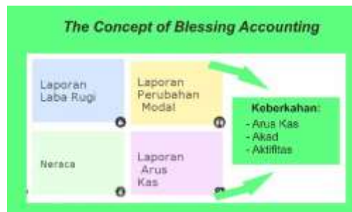
Figure 1. Concept of Implementing Blessing Accounting

In the application of the concept of accounting blessings, students at Dayah must master the basic knowledge of finance in accounting to the ability to understand intermediate starting from Profit and Loss, Changes in capital, balance sheets and cash flow. So, after they can master the basics, especially understanding where the flow of money comes in and out, they can learn the concept of blessings.