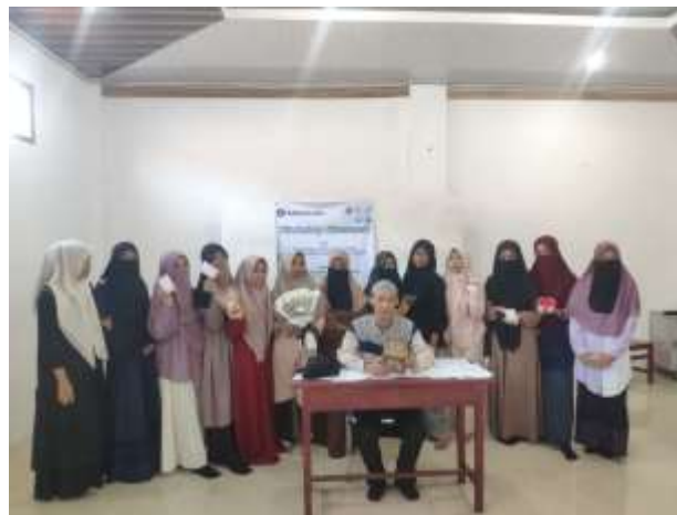
Figure 7. Providing mentoring and evaluation