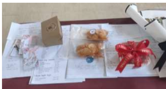
Figure 6. Financial Report of Blessing Accounting in Product Sales