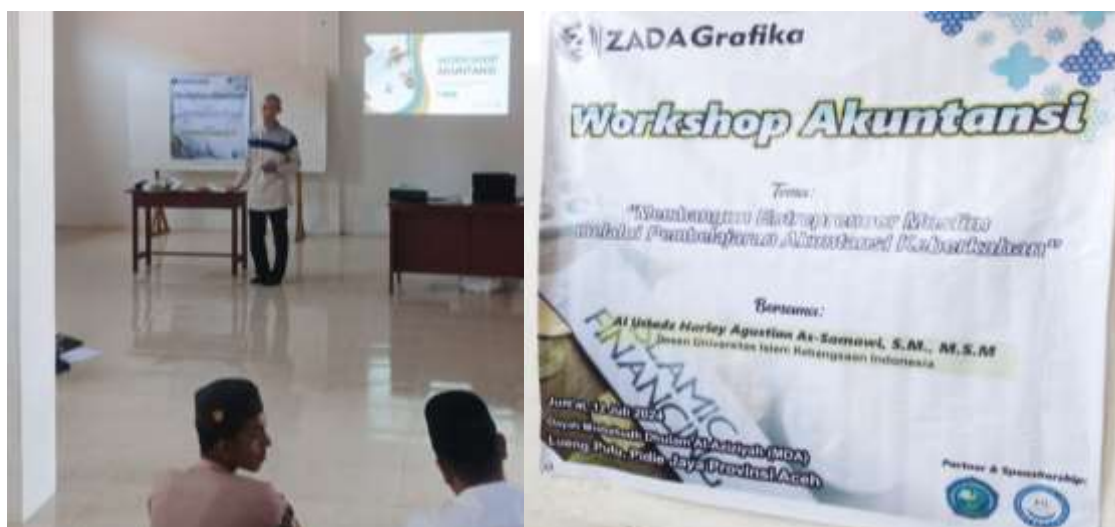
Figure 2. Blessing Accounting & Young Entrepreneur Implementation Program

Harley Agustian 1 , Fajriah 2 , Usman Boini 3 , Fazil 4 , Husni Rahmah 5 , Zulaiva ulya 6 , M. Syukur 7