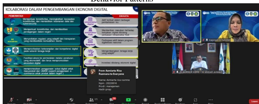
Figure 2. Implementation of the Presidential Regulation Webinar Regarding Digital Transformation and Strengthening Economic Foundations in the Era of Digitalization on Consumer Behavior Patterns