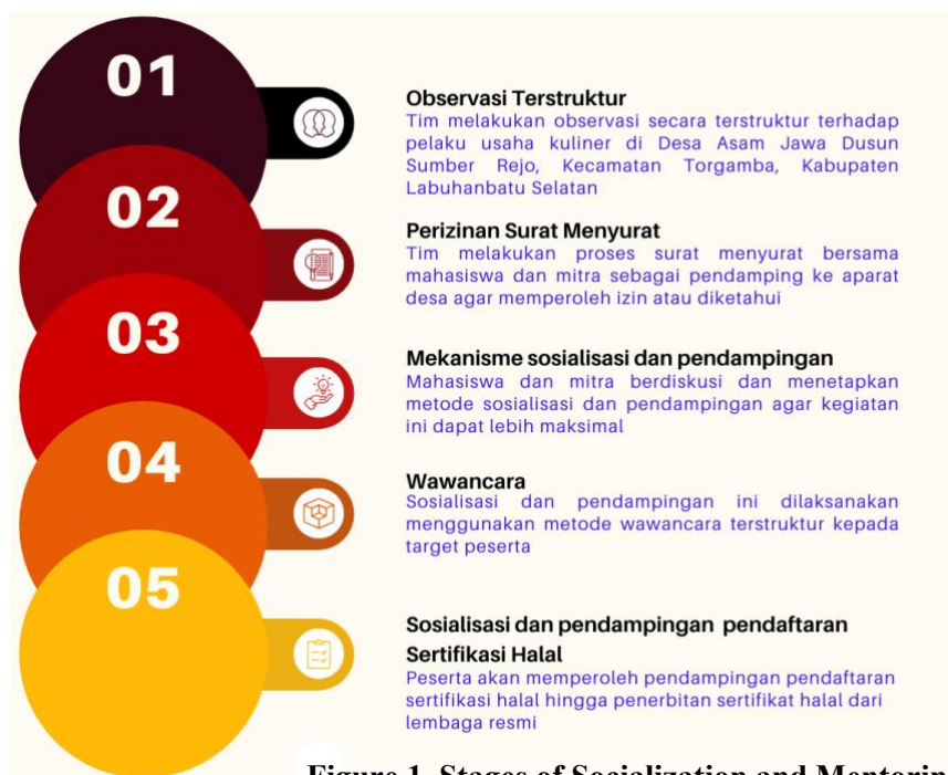
Figure 1. Stages of Socialization and Mentoring

to door or in other words visiting one place to another (Dewi et al., 2022). This method is considered more appropriate because if gathered in one place, culinary business actors or target participants cannot divide their time so that socialization and mentoring are not optimal (Nafisha & Arif, 2021). Therefore, the method of implementing socialization and mentoring halal certification label registration for culinary business actors Asam Jawa Village, Sumber Rejo Hamlet, Torgamba District, South Labuhanbatu Regency has the following stages: