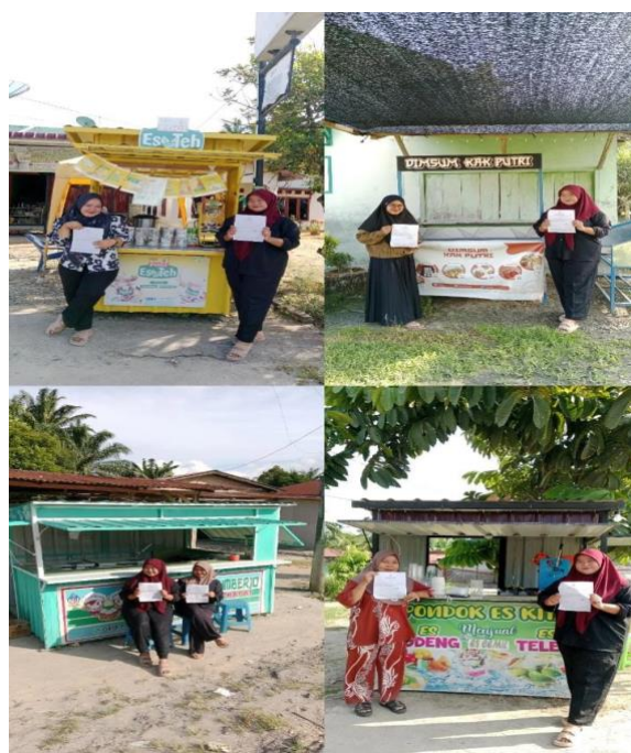
Figure 3. Interview with Business Actors

At this moment, the mentoring team will personally explain to the target the definition, meaning and importance of halal product certification for business actors while measuring the level of literacy regarding halal certification and its benefits for business development.