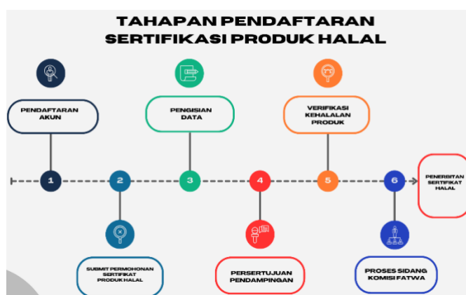
Figure 2. Stages of Halal Certification Registration

After the implementation of community service socialization regarding the importance of halal product certification to Asam Jawa Village, Sumberjo Hamlet, Torgamba District, South Labuhanbatu Regency. So the next step is for the resource person to provide information and the flow of halal certification registration and assistance.