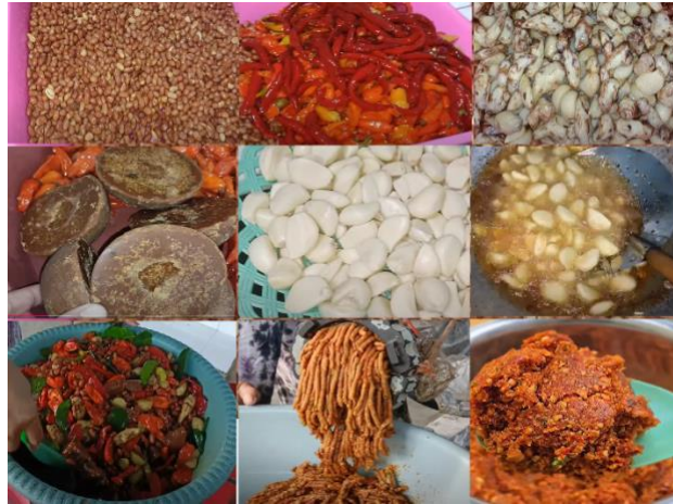
Figure 4. Peanut Sauce Product Production Process

However, before registering for the SIHALAL application, the assistance team must first ensure that the recommendations given have met the applicable requirements in the halal certification process. On this occasion, the assistance team will conduct socialization and assistance for SIHALAL application registration and explain the documents required in the registration process for the SIHALAL application. The following is a display of the SIHALAL application socialization.