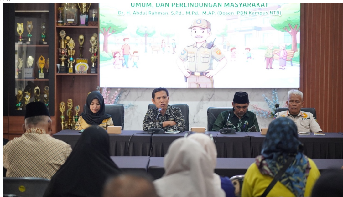
Figure 3. Presentation of Material by IPDN NTB Lecturer