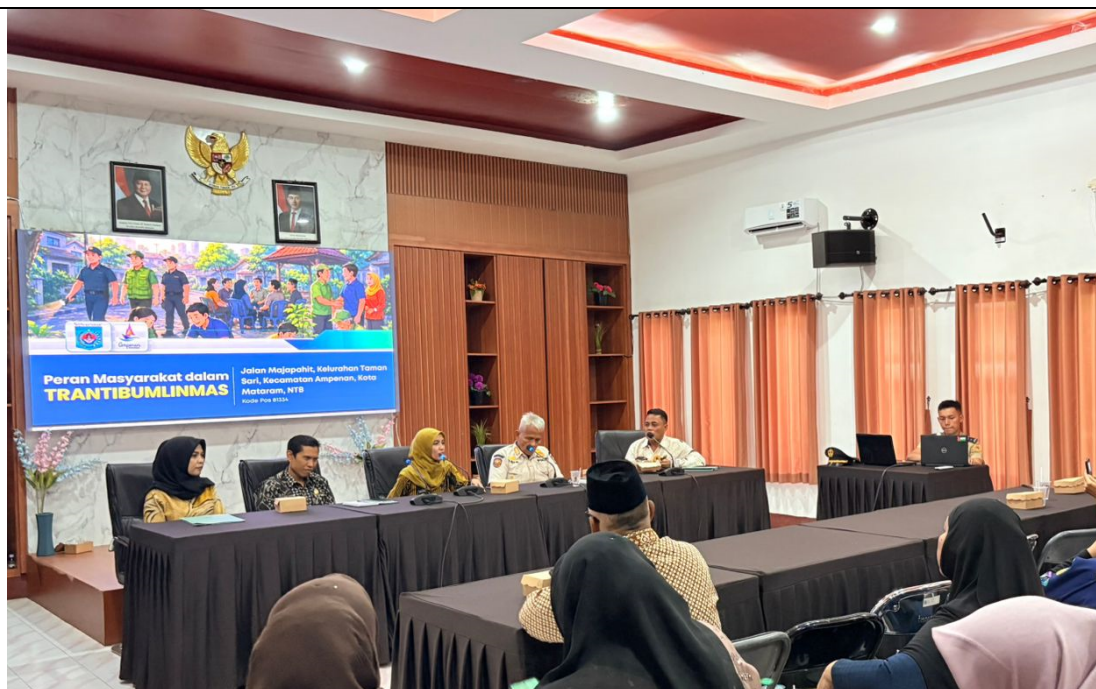
Figure 2. Presentation of Material by the Head of Ampenan District