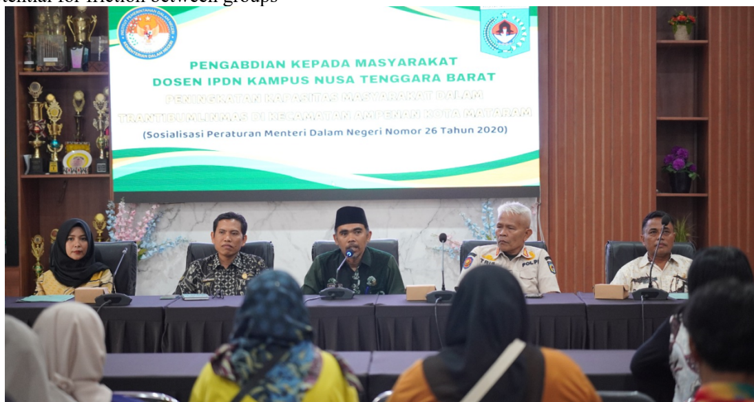
Figure 5. Preparation of material by the Sub-district Secretary of Ampenan District