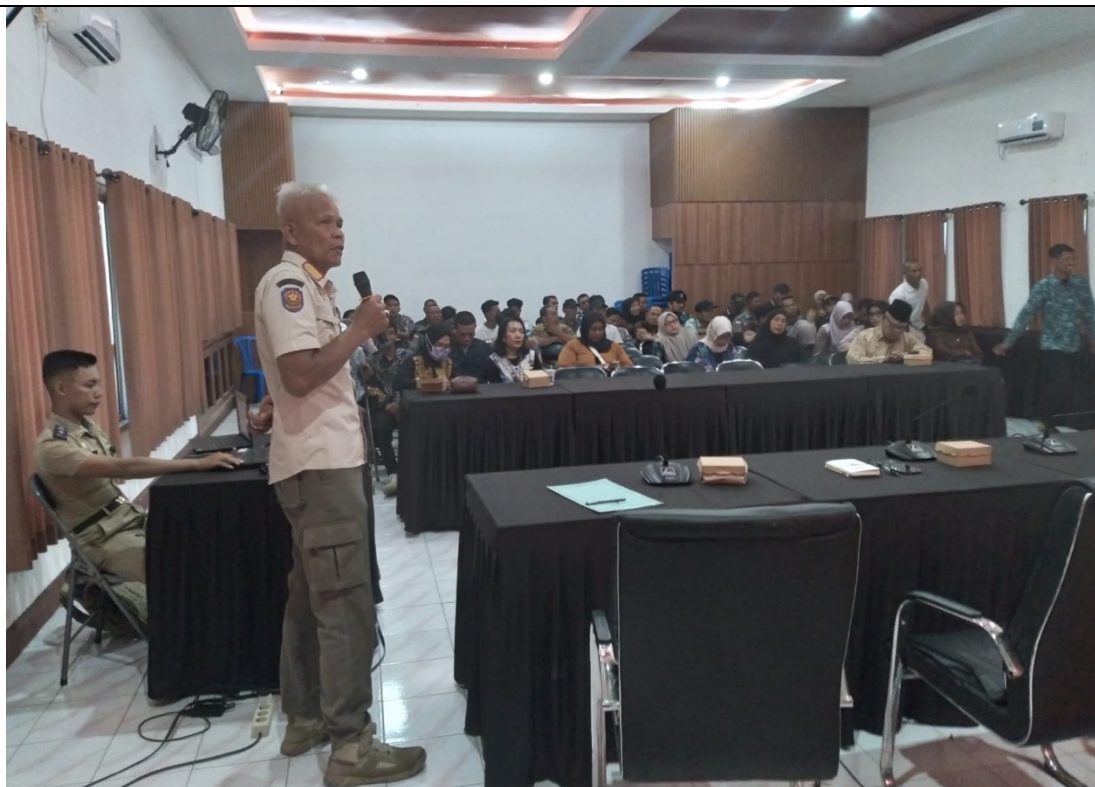
Figure 4. Presentation of material by the Head of Public Order and Public Order, Mataram Satpolpp