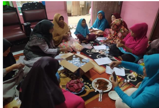
Packaging of shredded fish and fish crackers