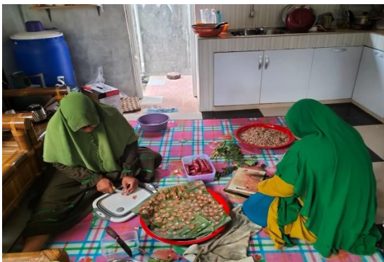
Production of shredded fish and fish crackers

This training was closed with a photo session with the service team with the training participants.