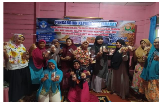
Products ready to be marketed