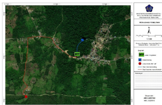
Figure 2.1 Map of Existing Raw Water Source Locations